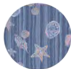
Shells & Stripes