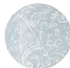
Batik Scroll Light Blue