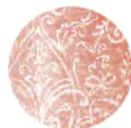
Batik Scroll Red