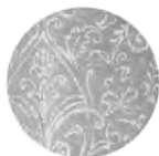
Batik Scroll Gray