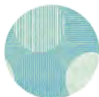
Circles & Stripes Aqua