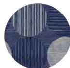
Circles & Stripes Sapphire/Navvy