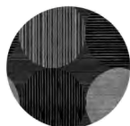
Circles & Stripes Black/Gray